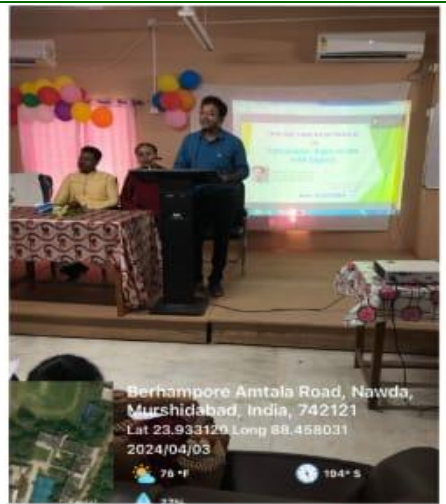
Berhampore Amtala Road, Nawda, Murshidabad, India, 742121 Lat 23.933120 Long 88.458031 2024/04/03