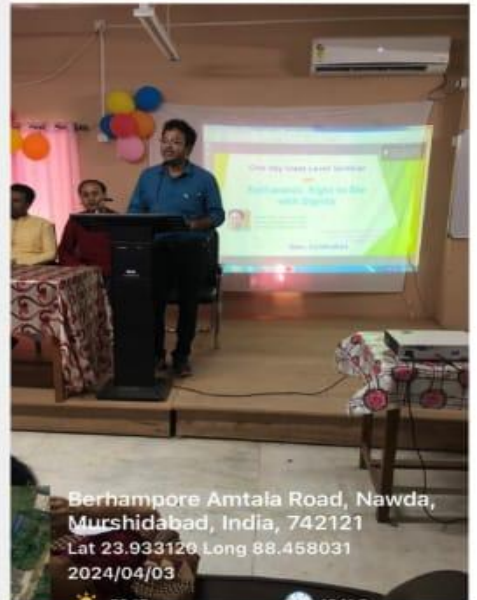
Berhampore Amtala Road, Nawda, Murshidabad, India, 742121 Lat 23.933120 Long 88.458031 2024/04/03