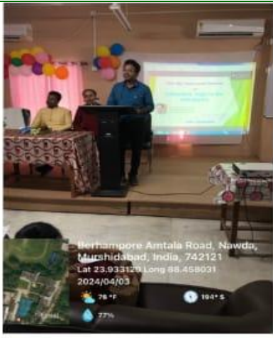
Berhampore Amtala Road, Nawda, Murshidabad, India, 742121 Lat 23.933120 Long 88.458031 2024/04/03