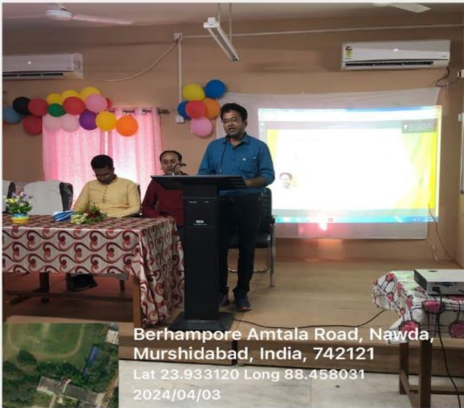
Berhampore Amtala Road, Nawda, Murshidabad, India, 742121 Lat 23.933120 Long 88.458031 2024/04/03