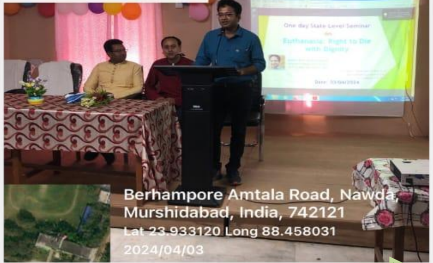
Berhampore Amtala Road, Nawda, Murshidabad, India, 742121 Lat 23.933120 Long 88.458031 2024/04/03