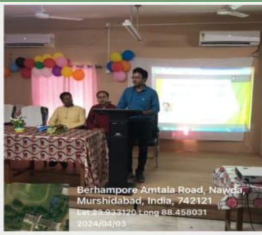
Berhampore Amtala Road, Nawda, Murshidabad, India, 742121 Lat 23.933120 Long 88.458031 2024/04/03